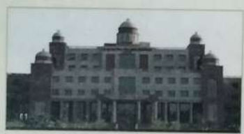
DR. SHAKUNTALA MISHRA REHABILITATION UNIVERSITY