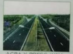
AGRI X-PRESS WAY